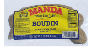
12 oz. Boudin Links