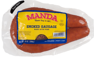
13 oz. Sausage Loop

"The #1 Smoked Sausage Consumed in the Central Gulf Coast" - Nielsen, 2019