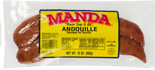
12 oz. Andouille Links