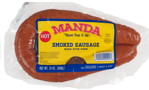
13 oz. Hot Loop