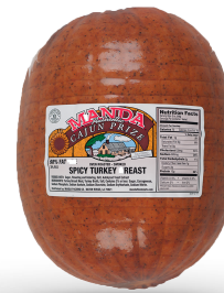
Spicy Turkey Breast

More flavors, sizes, and types of sausage and deli service meats are available.